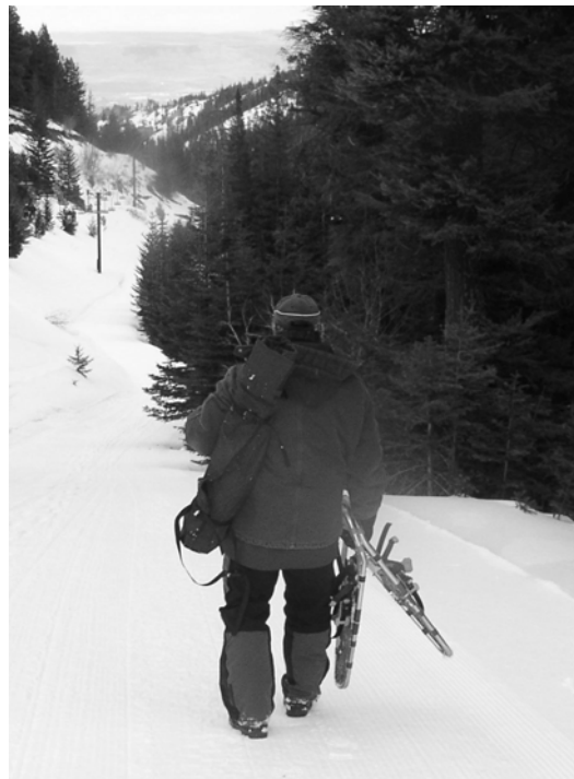
One last rip down the mountain for snow survey.