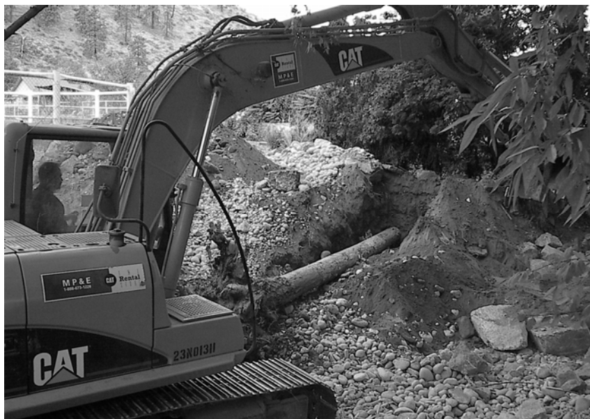
A contractor installs a root wad at the Mission Creek project area. Three root wads and a rock weir were installed to help stabilize the streambank by redirecting the flow of water to the center of the stream channel. The root wads also provide fish habitat by increasing stream channel complexity.

An engineering design was developed and instream work permits were applied for in 2004. The final project plan addressed the erosion issue and improved fish habitat. "Not only did the Conservation District work with us to make the project happen, they kept us informed along each step of the way," Joni said. "The Conservation District was able to make it happen and they went above and beyond my expectations."