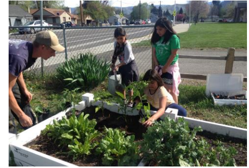
After School Gardening