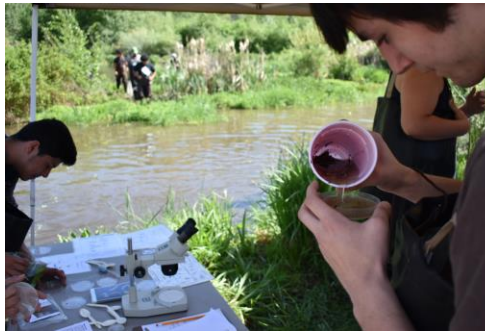
Kids in the Creek