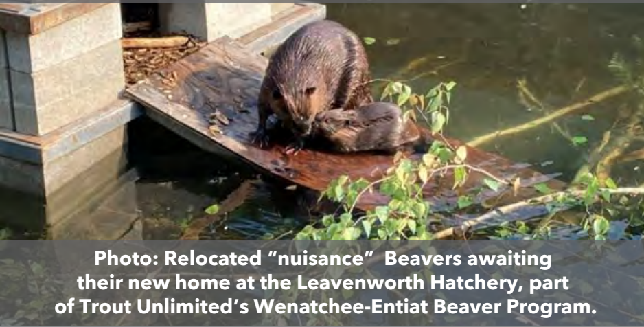
Photo: Relocated "nuisance" Beavers awaiting their new home at the Leavenworth Hatchery, part of Trout Unlimited's Wenatchee-Entiat Beaver Program.

Baby beavers, called kits, would be a quick snack for any hungry predator if they were not protected. As the new young are settling into their wetland fortresses, the two-year-old beavers are saying farewell to mom and pop. Sub-adults will be dispersing this spring, looking for a new stretch of stream to call their own.