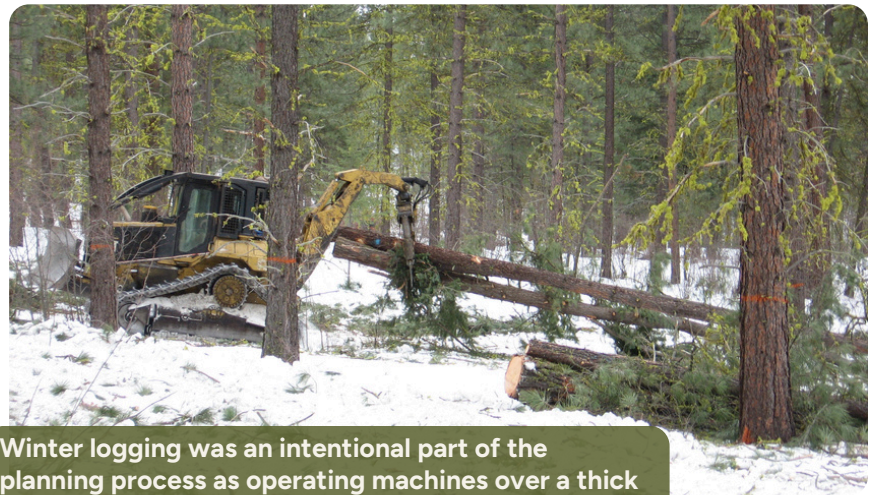
Winter logging was an intentional part of the planning process as operating machines over a thick layer of snow is a great way to reduce soil impacts.

Two timber sales are currently being implemented in the Meadow Creek watershed north of Lake Wenatchee. The sales were purchased by two different companies who employ 15-20 operators, 25 log truck drivers, and are bringing roughly 700 truckloads a month to mills in Randle, Darington, Morton, and Onalaska.