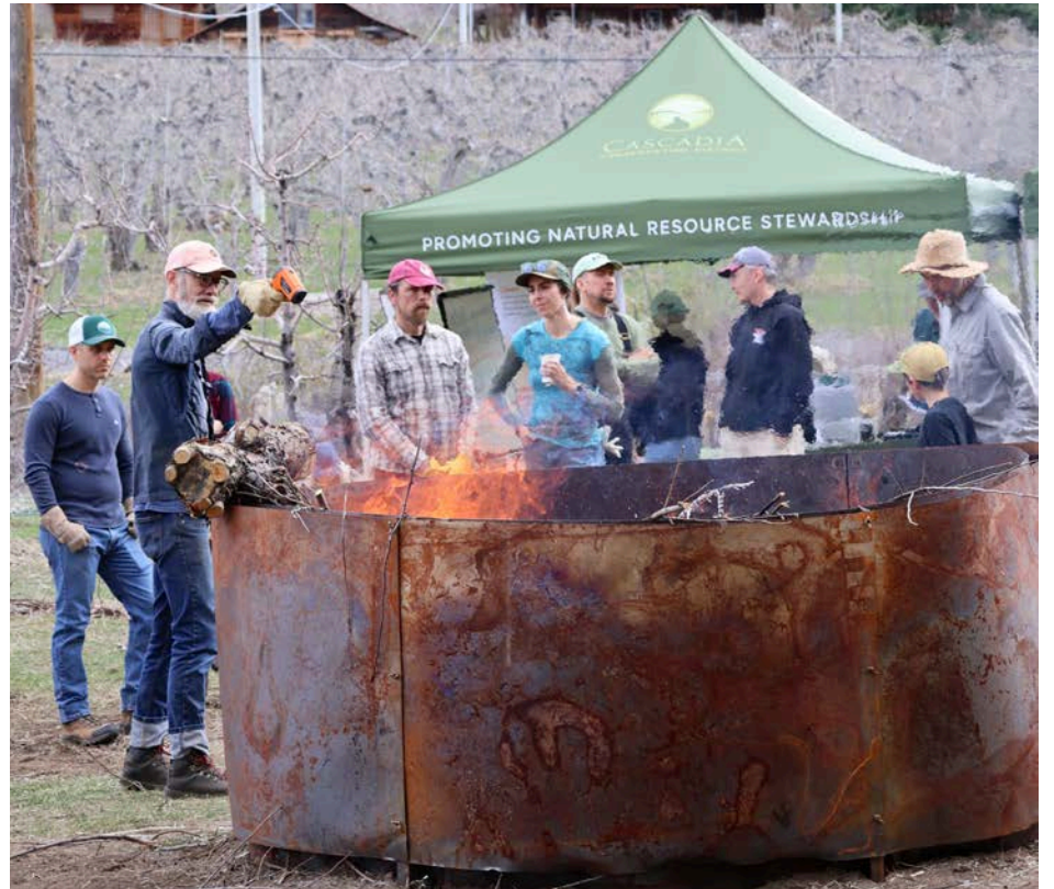
Workshop participants, through the heat haze of the biochar kiln, on March 20 th.

In a post-workshop survey, one participant shared: “The whole workshop was excellent. Everyone who presented had a lot of useful information and were very knowledgeable and experienced in their fields. When we signed up, we thought we’d come and go throughout the day because six hours seemed like a long time. But the time flew by, and there was so much to learn that we didn’t leave—we didn’t want to miss anything!”