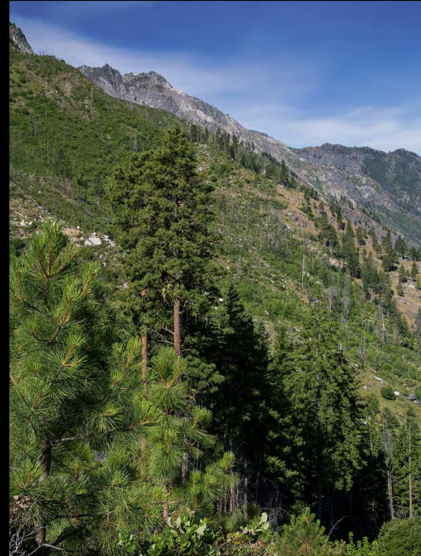
Following Landscape Change After Wildfire, 1994-