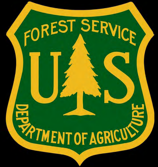
Entiat Ranger District